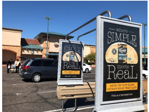
Note: Optional aisle marker available